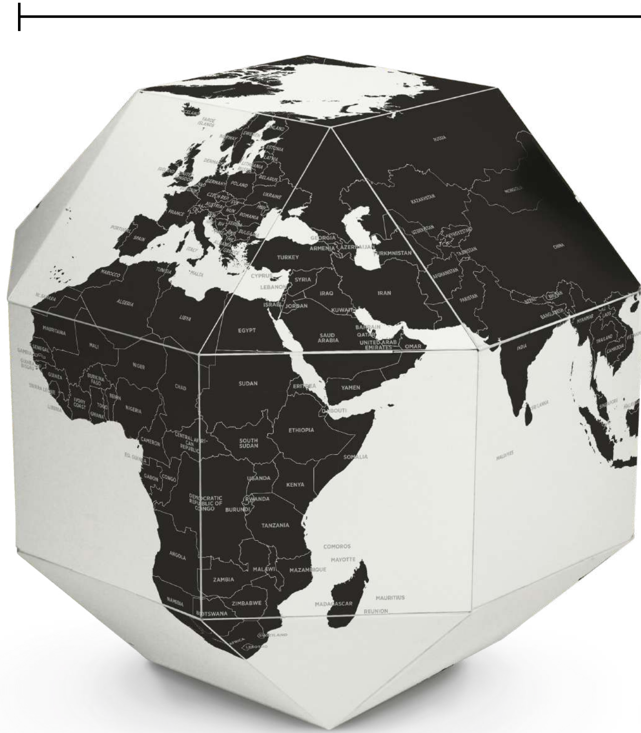
MEDIUM Ø 28 cm