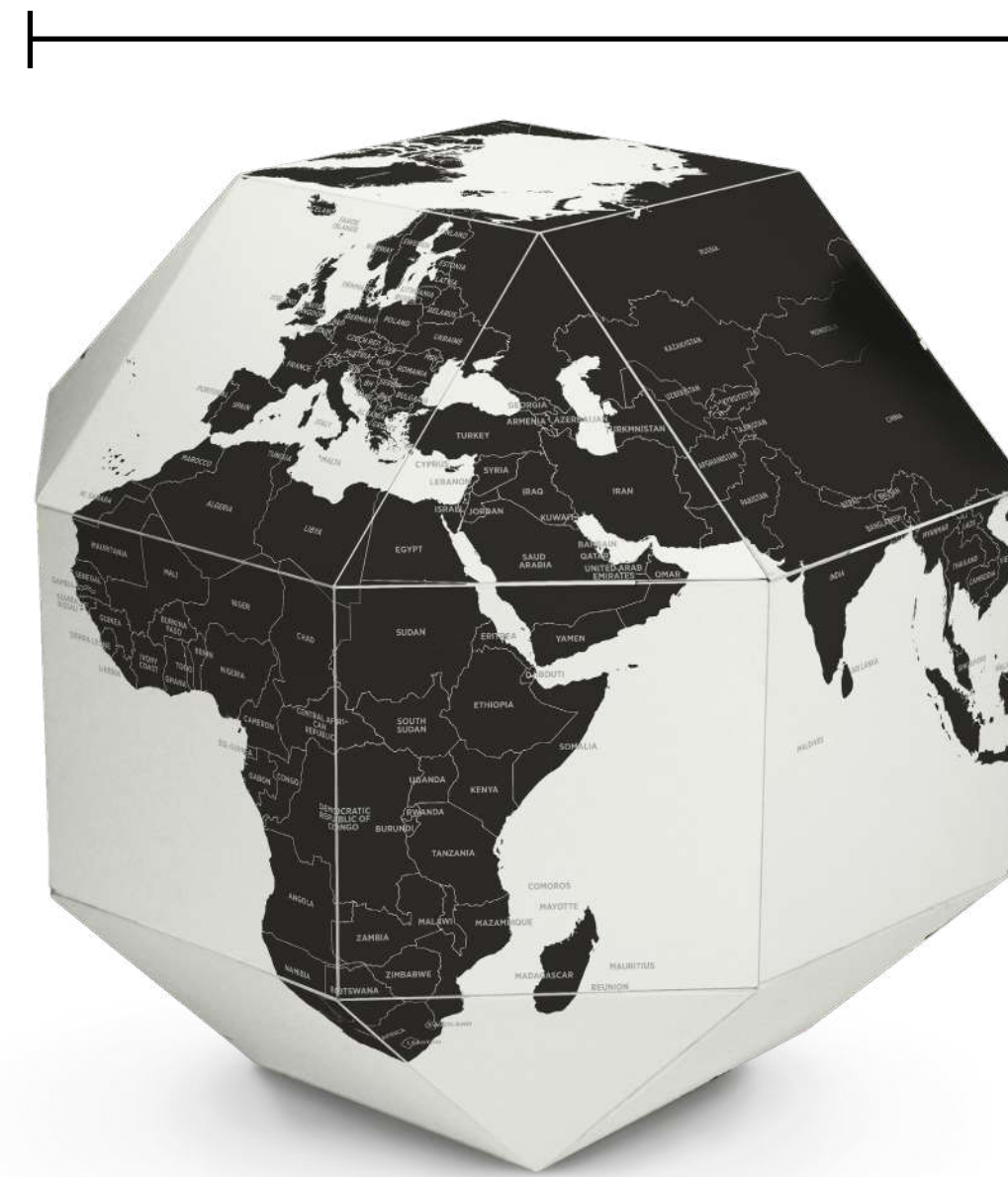
XSMALL Ø 16,5 cm