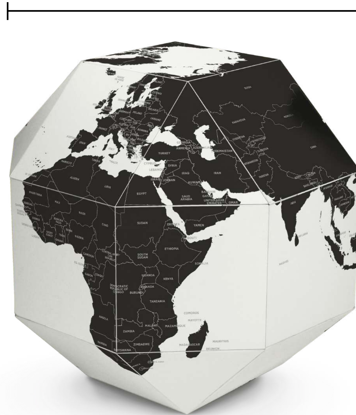
SMALL Ø 21 cm