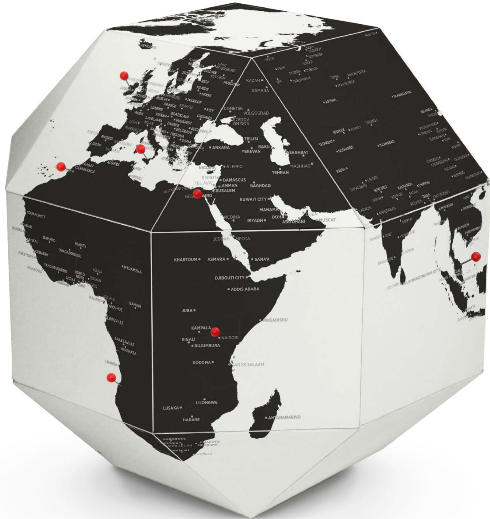
WITH CITY NAMES