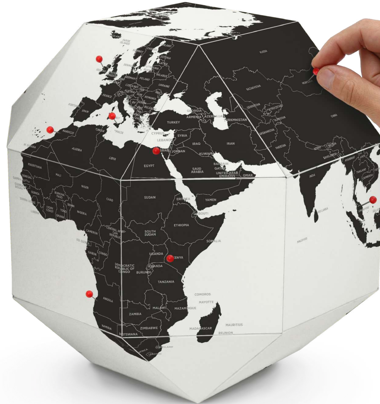
WITH COUNTRY NAMES