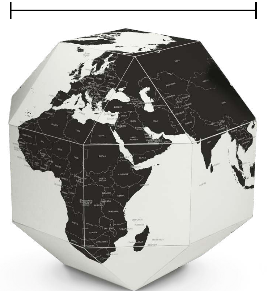
XXSMALL Ø 14 cm